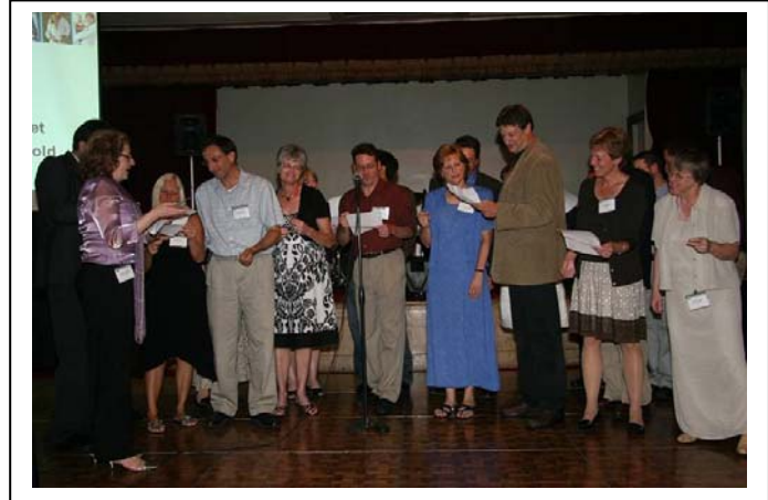
Duop Performance by Participants of the 3 rd Strategic Planning Session.

In addition to these specific activities, the committee will be working over the next few months to develop a comprehensive proposal to revamp the site . Elements of this proposal will include, but not be