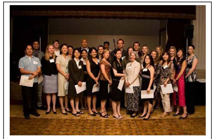
Student/Postdoc Travel Awardees at the 2007 Annual Meeting.