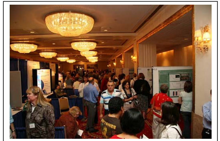
One of two very busy poster sessions at the 2007 Annual Meeting in Pittsburgh.

limited to: types of content to add, retain or eliminate; enhanced functionalities (e.g., bulletin boards); more attractive and inviting appearance; improved presentation of the Teratology Society's image to the public; and, of course, the cost associated with such changes. The committee will be working closely with Council and the Strategic Planning Communications Work Group to advance these initiatives. ■